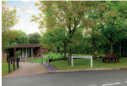
Cedarwood Centre at Willowbrook.

Alongside all these developments, the Trading Company portfolio of shops has also changed considerably, with Willowbrook now operating out of nine retail spaces across St Helens and Knowsley.