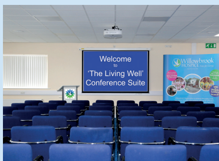
The Alexandra Suite is ideal for meetings.