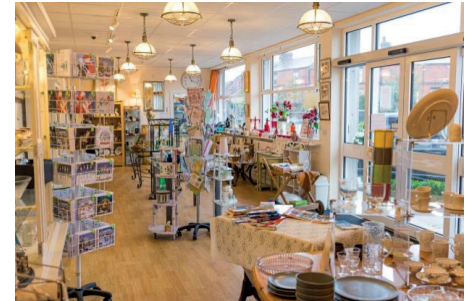
Our shop at The Living Well.