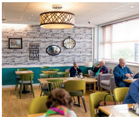
The Living Well's bright, spacious café.