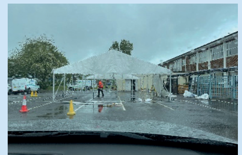
Our marquee being erected in 2020.

If you would like to find out more, please visit our website www.willowbrook.org.uk or contact us at events@willowbrookhospice.org.uk and see what we can offer.