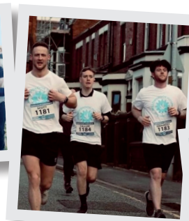
Running for Willowbrook with friends.

activities are also planned to include a charity football and a rugby match.