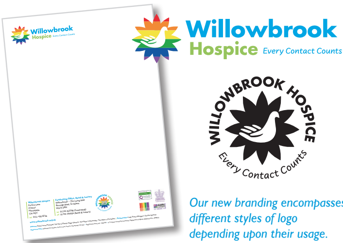
Our new branding encompasses different styles of logo depending upon their usage.

We now have an improved interface with our NHS colleagues, have the ability to connect with more of our patients in their own homes and can deliver swift advice when required to patients who cannot travel to the hospice. With judicious spending, we also retained sufficient money to upgrade our website. At the same time, we have refreshed our logos and letterheads, below left, and we launch these as part of our 25th Anniversary celebrations. We hope you like them!