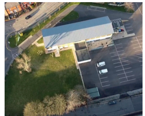
The Living Well from above.