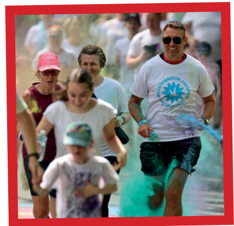
The Colour Run participants had the opportunity to take part wearing our branded clothing... just as the team did above as well!