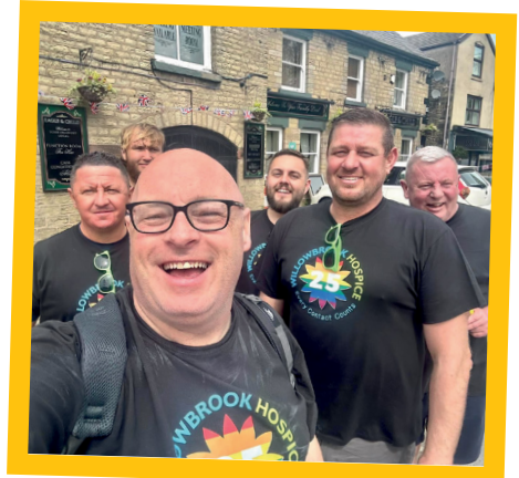
A team from The Boars Head pub in St Helens walked from Wigan RUFC to St Helens RUFC and then back to the pub raising money along the way.

Please ask the Fundraising Team for more information using the contact details above.