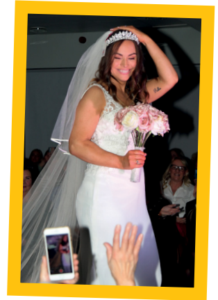
We held a successful fashion show raising over £3500.

In 2022, it cost £4.8m to run all our services with 56% funded by Willowbrook supporters.