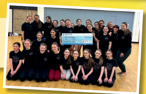
'Be in a Show' raised a fabulous £2,000 from holding raffles at their performances!

Click the button below for help on your fundraising journey for Willowbrook.